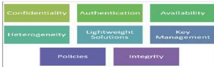
Figure 2. IoT security principles

Lightweight Solutions -All of the security intentions considered earlier is not peculiar to IoT, although it may add special characteristics and constraints to each of them. However, in general confidentiality, integrity, availability and authentication are treated as basic intention in every computer or network security.