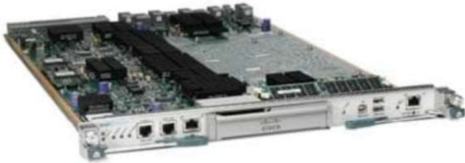
Nexus 7000 Sup 1