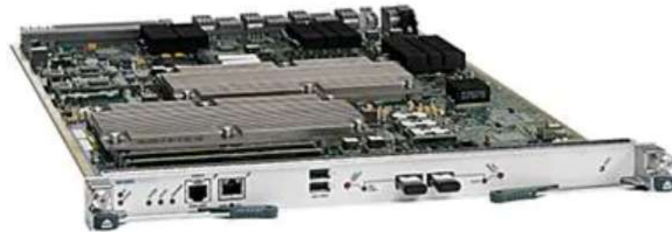
Nexus 7000 Sup 2E