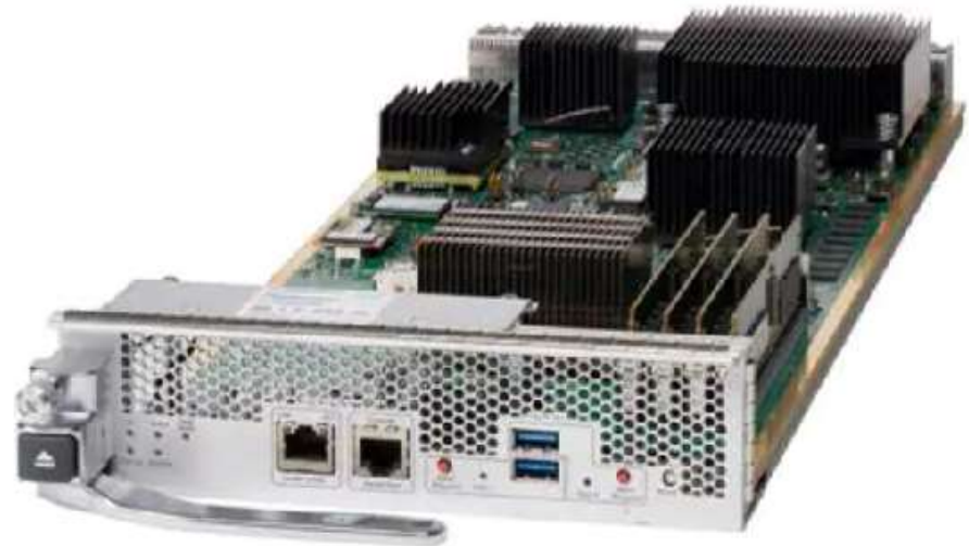
Nexus 7700 Sup 3E