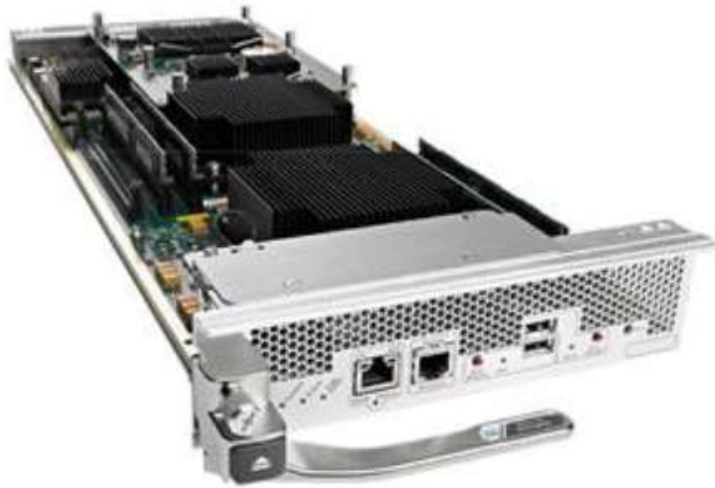
Nexus 7700 Sup 2E