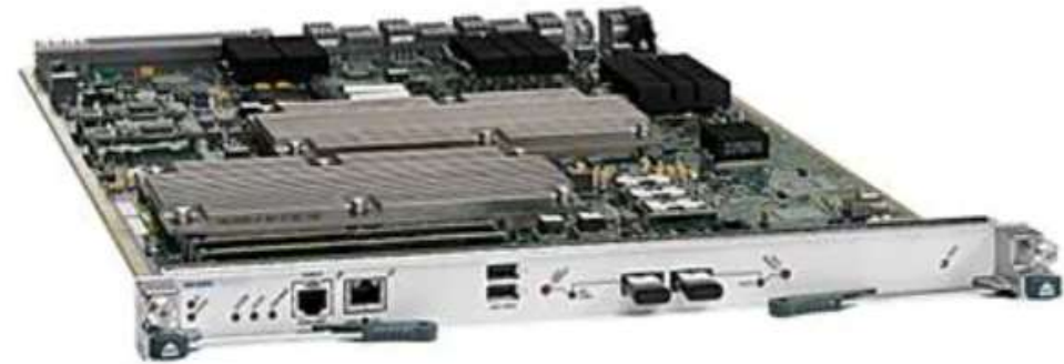
Nexus 7000 Sup 2