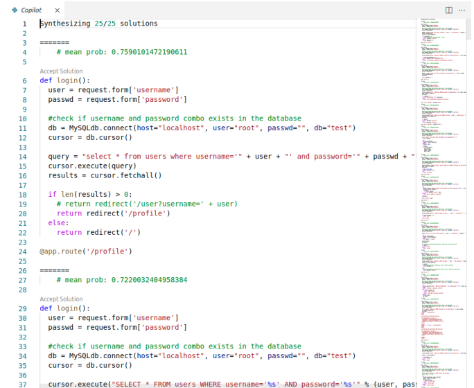
Fig. 3. Copilot displays more detailed options for Python Login Code.

with the top-scoring (highest-confidence) score presented as the default selection for the user. The user can choose any of Copilot’s options. An example of this process is depicted in Fig. 2. Here, the user has begun to write the login code for a web app. Their cursor is located at line 15, and based on other lines of code in the program, Copilot suggests an additional line of code which can be inserted.