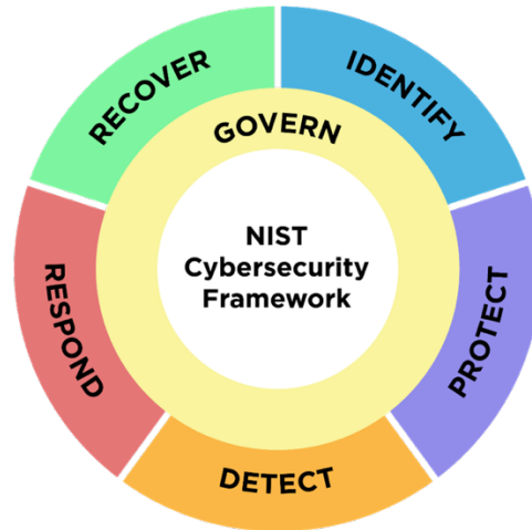
Fig. 2. CSF Functions

The Functions should be addressed concurrently. Actions that support GOVERN, IDENTIFY, PROTECT, and DETECT should all happen continuously, and actions that support RESPOND and RECOVER should be ready at all times and happen when cybersecurity incidents occur. All Functions have vital roles related to cybersecurity incidents. GOVERN, IDENTIFY, and PROTECT outcomes help prevent and prepare for incidents, while GOVERN, DETECT, RESPOND, and RECOVER outcomes help discover and manage incidents.