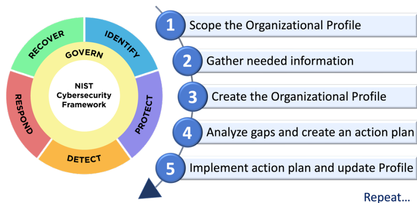
Fig. 3. Steps for creating and using a CSF Organizational Profile

The steps shown in Fig. 3 and summarized below illustrate one way that an organization could use an Organizational Profile to help inform continuous improvement of its cybersecurity.