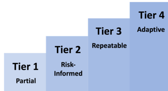
Fig. 4. CSF Tiers for cybersecurity risk governance and management

continuously improving. Selecting Tiers helps set the overall tone for how an organization will manage its cybersecurity risks.