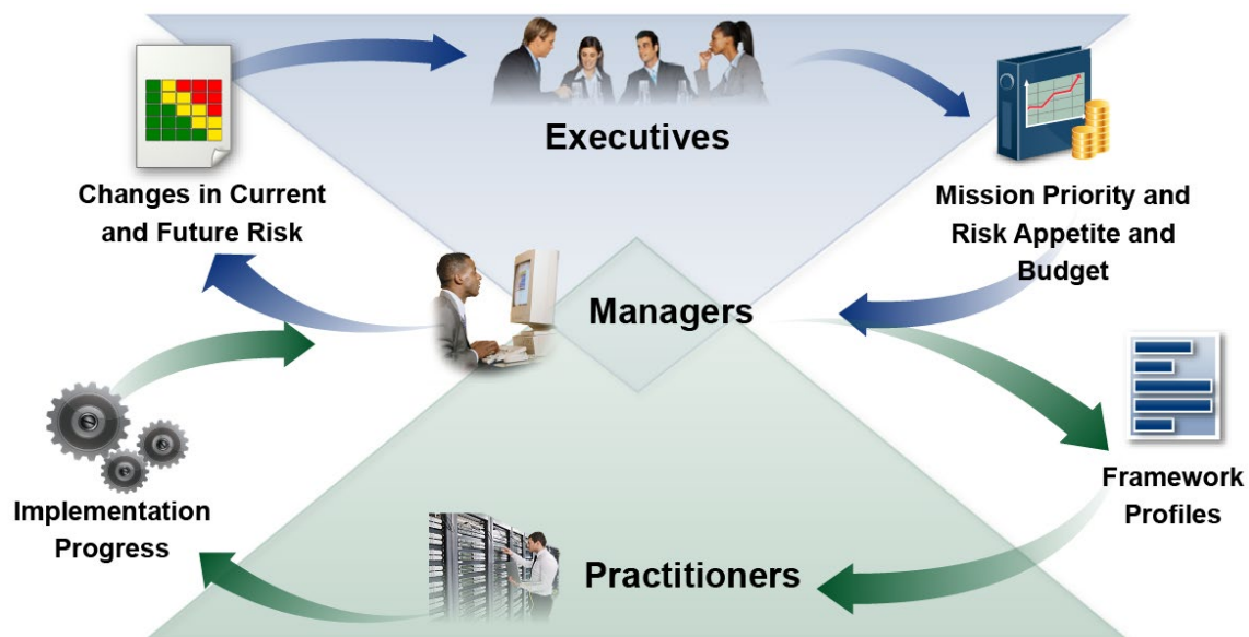
Fig. 5. Using the CSF to improve risk management communication

The CSF provides a basis for improved communication regarding cybersecurity expectations, planning, and resources. The CSF fosters bidirectional information flow (as shown in the top half of Fig. 5) between executives who focus on the organization's priorities and strategic direction and managers who manage specific cybersecurity risks that could affect the achievement of those priorities. The CSF also supports a similar flow (as shown in the bottom half of Fig. 5) between managers and the practitioners who implement and operate the technologies. The left side of the figure indicates the importance of practitioners sharing their updates, insights, and concerns with managers and executives.