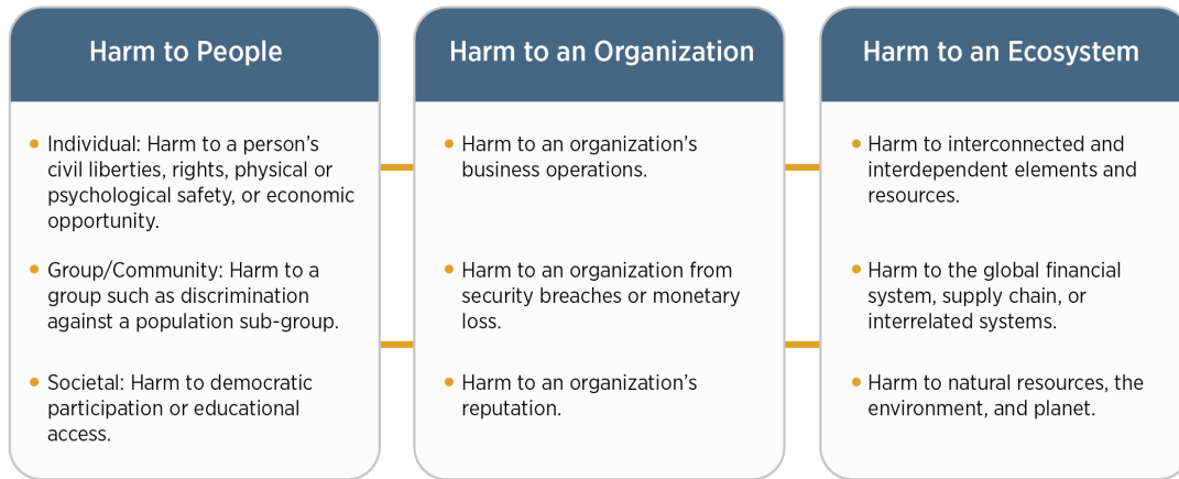
Fig. 1. Examples of potential harms related to AI systems. Trustworthy AI systems and their responsible use can mitigate negative risks and contribute to benefits for people, organizations, and ecosystems.