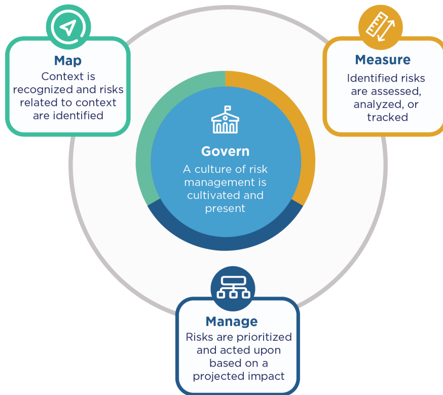
Fig. 5. Functions organize AI risk management activities at their highest level to govern, map, measure, and manage AI risks. Governance is designed to be a cross-cutting function to inform and be infused throughout the other three functions.

The AI RMF Core provides outcomes and actions that enable dialogue, understanding, and activities to manage AI risks and responsibly develop trustworthy AI systems. As illustrated in Figure 5, the Core is composed of four functions: GOVERN , MAP , MEASURE , and MANAGE . Each of these high-level functions is broken down into categories and sub-categories. Categories and subcategories are subdivided into specific actions and outcomes. Actions do not constitute a checklist, nor are they necessarily an ordered set of steps.