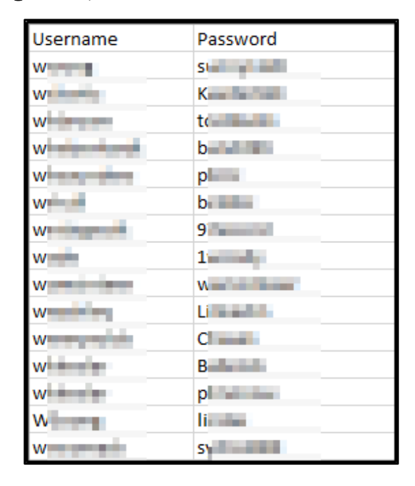
Figure 1: Sample list of breached user credentials

TCMS gathered historical breached data found in credentials dumps. The data amounted to 868 total account credentials ( Note: A full list of compromised accounts can be found in " Demo Company-867-19 Full Findings.xslx ".).