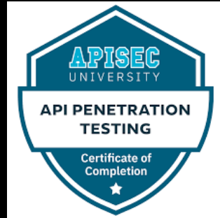
API PenTest (APISec University)