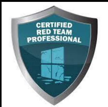
CRTP (Altered Security)