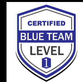
Blue Team Level 1 (Blue Team Labs)