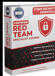
CRTS (Cyber Warfare Labs)