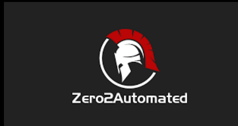
Advanced Malware Analysis (Zero2Automated)