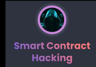
Smart Contract Hacking (smartcontractshacking. com)