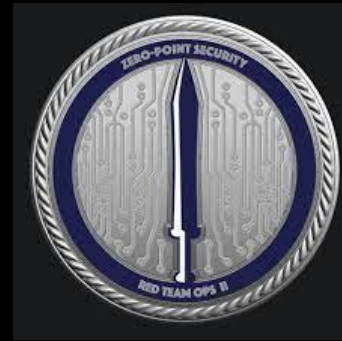
RED TEAM OPS I and II (Zero Point)