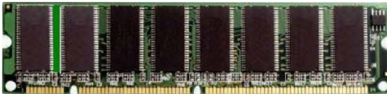
DIMM Unbuffered Non ECC 3,3 V