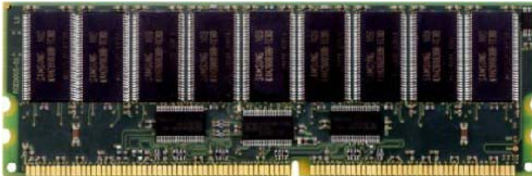
DDR Registered ECC 2,5 V