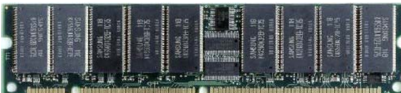
DIMM Buffered ECC 3,3 V