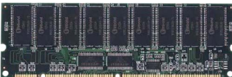
DIMM Buffered ECC 3,3 V