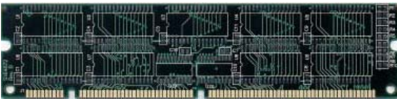
DIMM 1ª Gen Buffered ECC 3,3 V