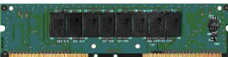
RIMM Unbuffered Non ECC 2,5 V